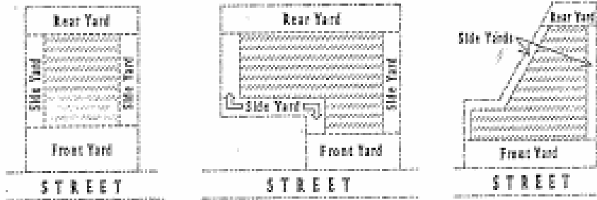
INTERIOR LOT EXAMPLES