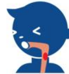
Thick grey membrane covering the back of the throat (appears within 2-3 days of illness)