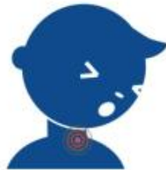
Sore throat and noisy breathing