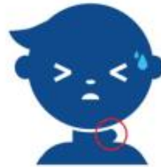
Swollen glands in the neck