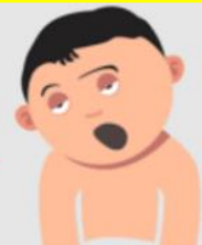
Lack of energy