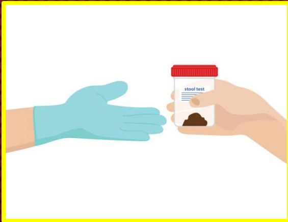
Istock. Stool Sample , 24 Feb. 2017. https://www.istockphoto.com/illustrations/stool-sample?sort=mostpopular&mediatype=illustration&phrase=stool%20sample