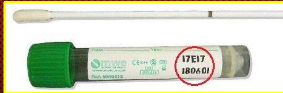
NHS Gloucestershire Hospitals. Enterovirus PCR-Viral Swab (Hand, Foot, Mouth) , n.d. https://www.gloshospitals.nhs.uk/our-services/services-we-offer/pathology/tests-and-investigations/enterovirus-pcr-viral-swab/