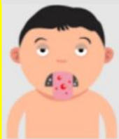
Painful sores in the mouth