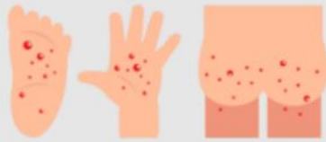
Skin rash with red spots and sometimes with blisters on the palms of the hands and soles of the feet, buttocks and genital area