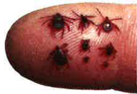
Larvae not shown