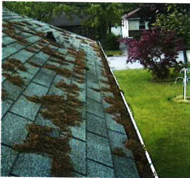
Improperly maintained gutters are habitats for nuisance and vector mosquitoes.

The most effective control of mosquitoes around the home is to prevent them from breeding. This can be done by eliminating or altering existing breeding sites as follows: