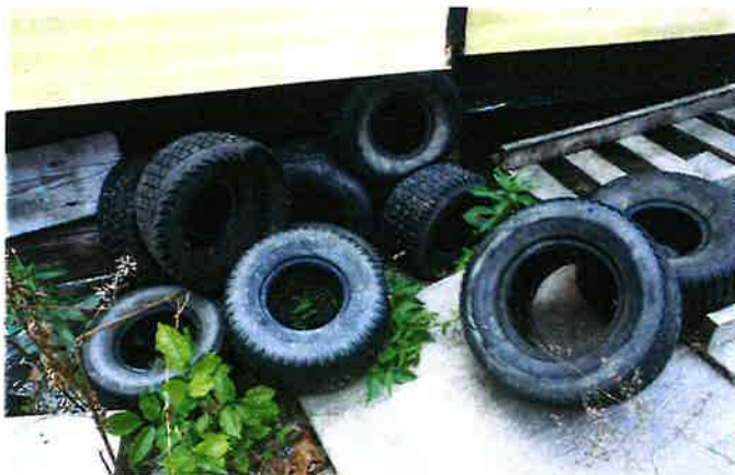
Old discarded tires are a breeding ground for mosquitoes.

Mosquitoes always develop in water, but the type of breeding place varies with the species of mosquito. Common breeding places are flood waters, woodland pools, slow-moving streams, ditches, marshes, and around the edges of lakes. Other mosquitoes develop in tree cavities, rain barrels, fish ponds, bird baths, old tires, tin cans, guttering, catch basins or any container that holds water. Diseases such as West Nile virus and Zika are transmitted by these container breeding mosquitoes.