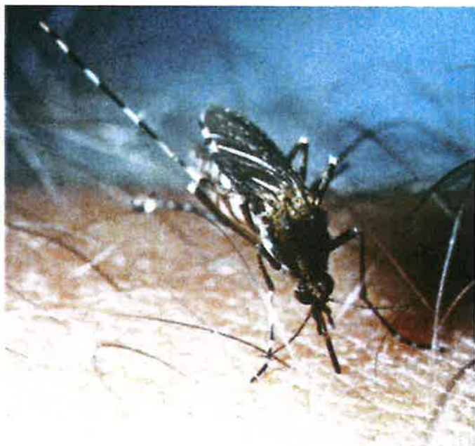
Female mosquito feeding.

Mosquito-borne viruses that have been of concern in Indiana include those that are responsible for causing such diseases as St. Louis Encephalitis, La Crosse fever, Eastern equine encephalitis, Western equine encephalitis, and West Nile virus. Wild birds serve as the reservoir. Mosquitoes feed on infected birds and transmit the virus to other birds. The virus becomes widespread in the wild bird population by midsummer, when mosquitoes are abundant. Some mosquitoes may become infected and transmit the virus to non-bird hosts such as people and horses between July and late October.